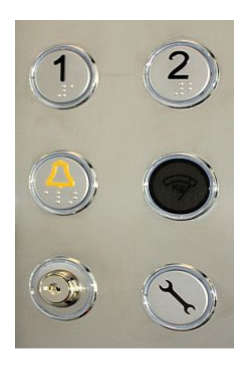
Exclusive In-Cabin Self-Rescue Feature Now Included As Standard