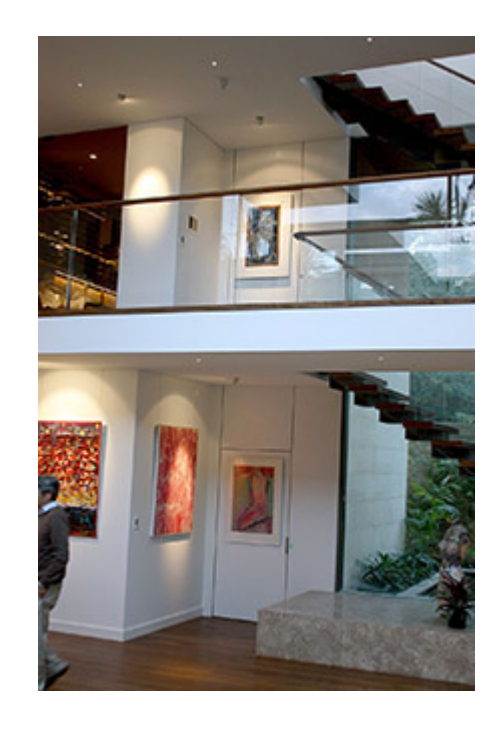
Can You Repeat That Please