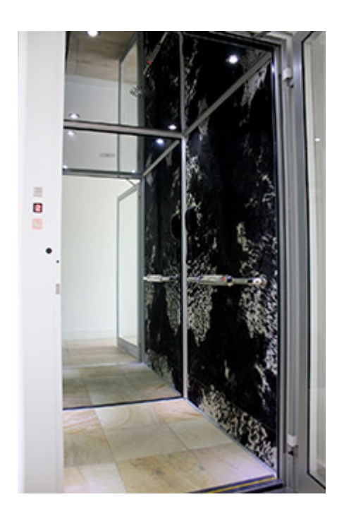
Cowhide Custom Finish