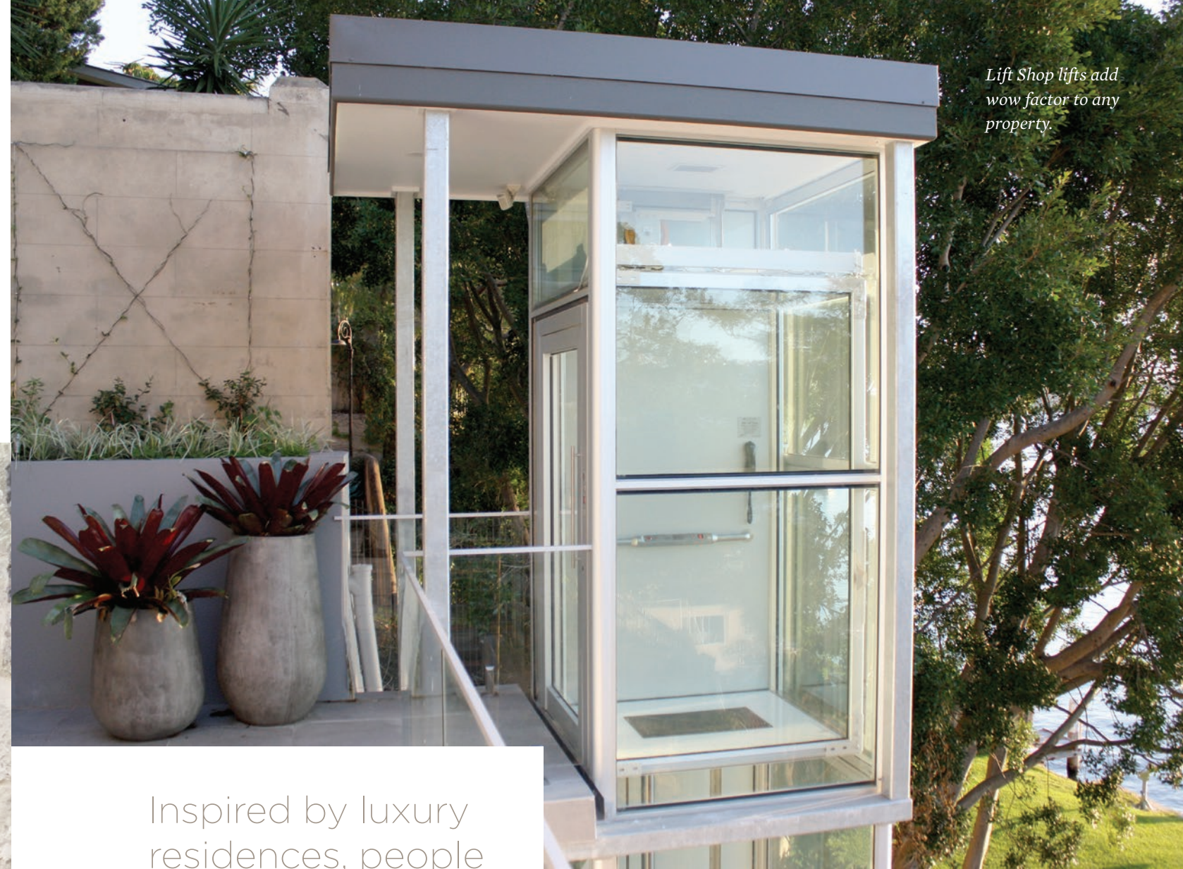
Lift Shop lifts add wow factor to any property.

“Lifts have become increasingly more affordable over the past ten years due to a combination of competition, exchange rates and mass production.”